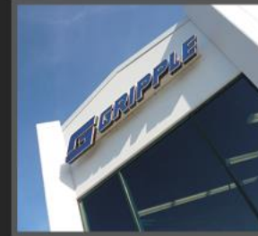
Grippple Americas Chicago, USA