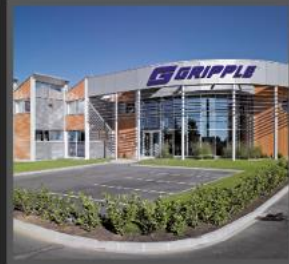
Grippple Europe Obernai, FR