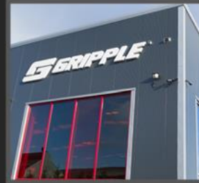
Riverside Works Sheffield, UK