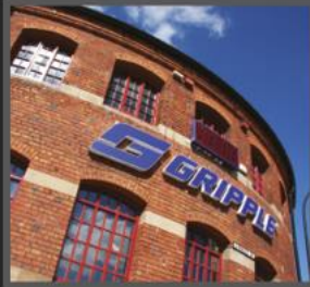
The Old West Gun Works Sheffield, UK (HQ)