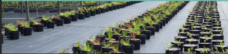
Landscaping & Nurseries