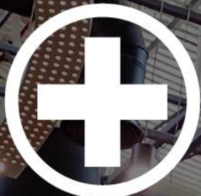
Health & Safety